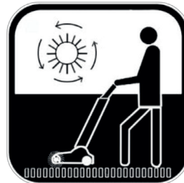
BRUSHING POWERED VACUUMING