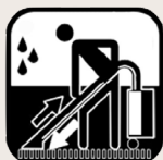
Spray extraction straight