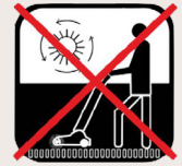
Brush vacuum cleaning